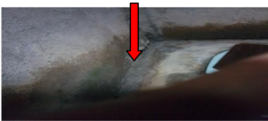
Figure 8. The floor of the 3 rd house cracked