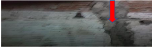
Figure 6. The wall of the 2 nd house cracked, covered with plaster