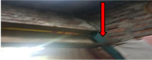
Figure 7. The wall of the 3 rd house cracked