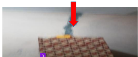
Figure 3. Cracked wall of the 1 st resident's house