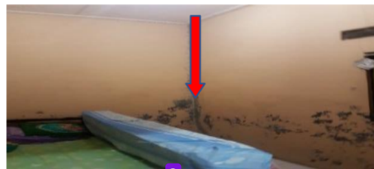
Figure 5. Wall-cracked restroom of the 1 st resident's house