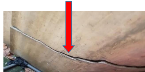
Figure 2 Back fence of the project, the boundary of the 1 st resident's house

The cause should be analyzed before the fence wall collapses its borders on the next-door neighbor due to groundwater dropping.