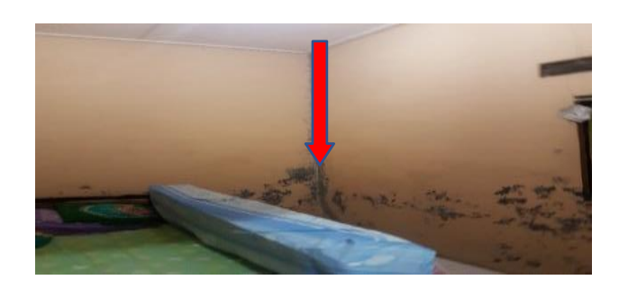
Figure 5. Wall-cracked restroom of the 1<sup>st</sup> resident's house