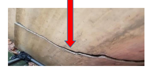
Figure 2 Back fence of the project, the boundary of the 1st resident's house

The cause should be analyzed before the fence wall collapses its borders on the next-door neighbor due to groundwater dropping.