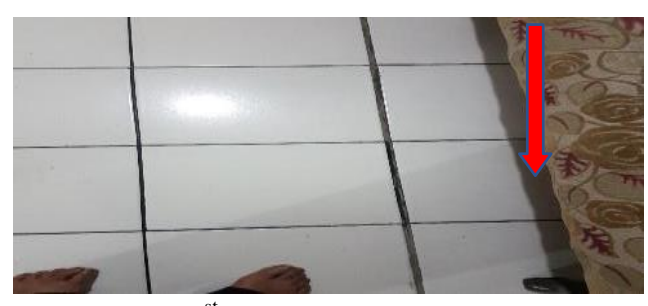
Figure 4. Slide floor of 1<sup>st</sup> resident's househouse