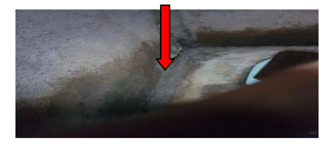
Figure 8. The floor of the 3<sup>rd</sup> house cracked