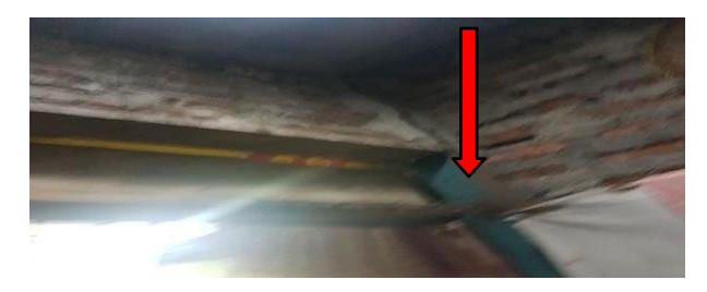
Figure 7. The wall of the 3<sup>rd</sup> house cracked