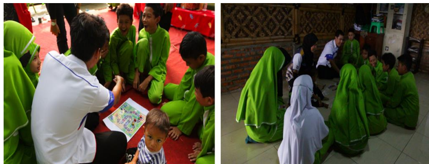
Figure 9. Group Division for Direct Composting

From the evaluation results of this activity, the division of small groups in hands-on practice of understanding traffic signs is very effective. Students can easily understand the instructions of traffic signs, and facilities for pedestrians.