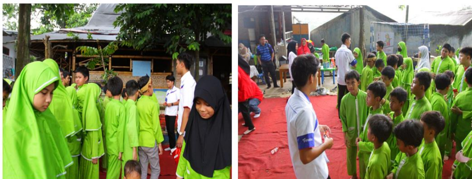
Figure 7. Giving material by UTHM students

In this activity a discussion and evaluation of the results of the socialization was also given, where at the end of the activity students were asked questions about the material that had been submitted as evaluation material for the implementing team. The evaluation technique used is to divide students into 5 groups assisted by students to practice directly with materials and materials that have been prepared by executors of community service activities. In these small groups they are given media quizzes in accordance with the theory and practice that has been given before.