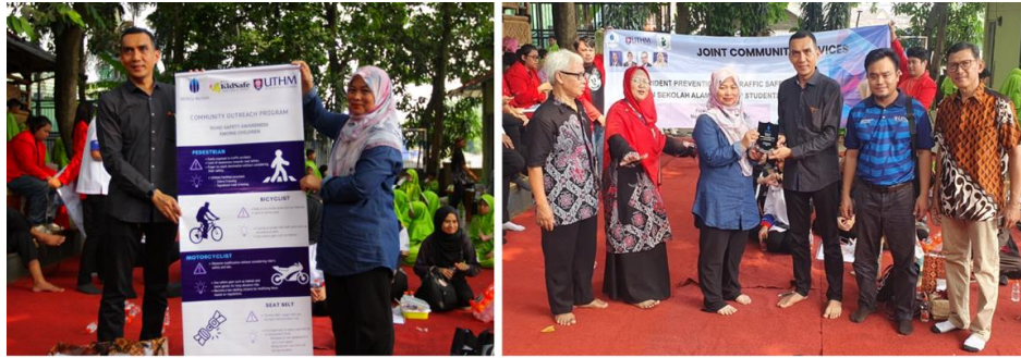
Figure 10. Bunting for KidSafe Banner Handover