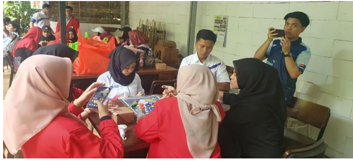
Figure 5. Make a traffic sign display