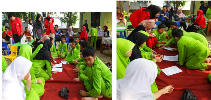
Figure 8. Small Group Division for Activity Evaluation

From the evaluation results of this activity, the division of small groups in hands-on practice of understanding traffic signs is very effective. Students can easily understand the instructions of traffic signs, and facilities for pedestrians.