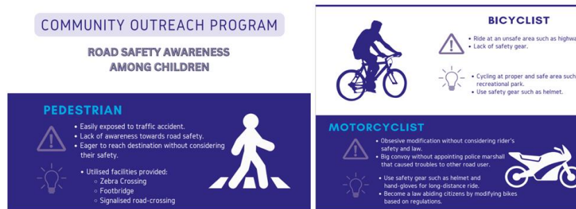
Figure 2. Good theory of pedestrian and cyclist behavior

The activity begins with providing theoretical material on good and correct traffic procedures and providing props for traffic signs.