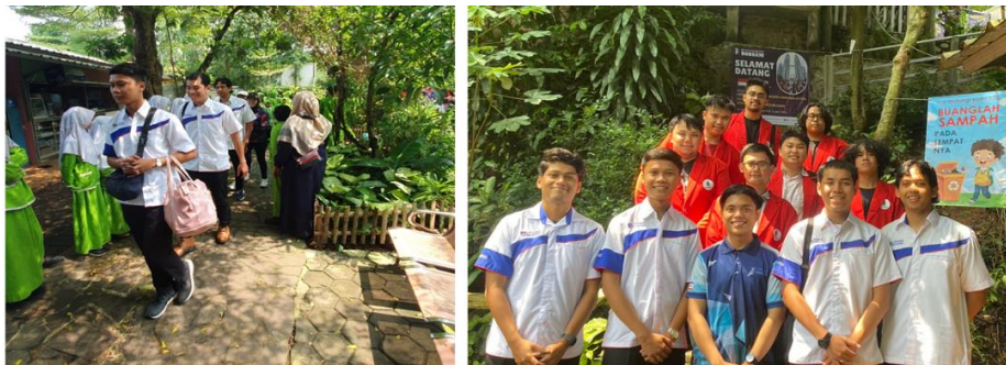
Figure 3. Participants from UTHM arrived at the activity location

This Joint Community Services activity was between Mercu Buana University and Universiti Tun Hussein On Malaysia (UTHM), 12 UTHM participants who attended consisted of 2 lecturers and 10 students from the Civil Engineering Study Program. Meanwhile, from Mercubuana University, 10 students and 2 accompanying lecturers attended.