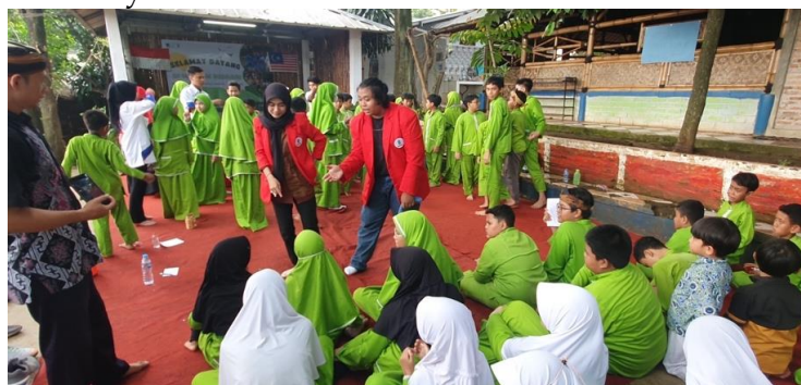
Fig 10. Material presentation activities by UMB students

The school also feels very helped and satisfied with this activity, because it provides new understanding for students and indirectly provides an independent attitude to students to be able to practice directly from the results of this activity. And the school feels that this activity is very positive and should be carried out sustainably in the future.