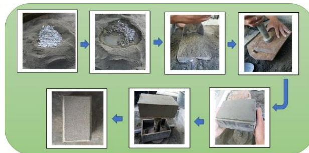
Figure 2. The process of making paving block sample

After all the materials used to make the paving blocks are ready, then all the ingredients are weighed according to the planned percentage variation. The process of making paper waste-based paving block specimens can be seen in Fig. 2. below: