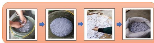
Figure 1. Paper waste treatment process

After all the materials used to make the paving blocks are ready, then all the ingredients are weighed according to the planned percentage variation. The process of making paper waste-based paving block specimens can be seen in Fig. 2. below: