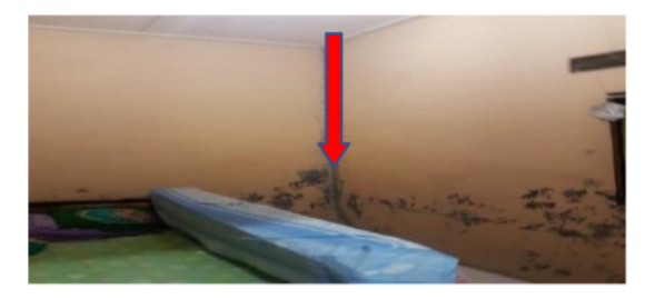
Figure 5. Wall-cracked restroom of the 1<sup>st</sup> resident's house