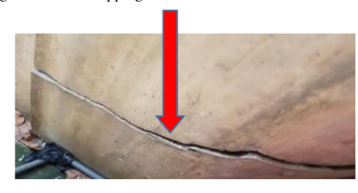
Figure 2 Back fence of the project, the boundary of the 1st resident's house

The cause should be analyzed before the fence wall collapses its borders on the next-door neighbor due to groundwater dropping.