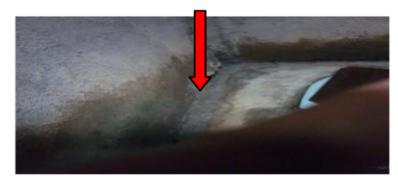
Figure 8. The floor of the 3<sup>rd</sup> house cracked