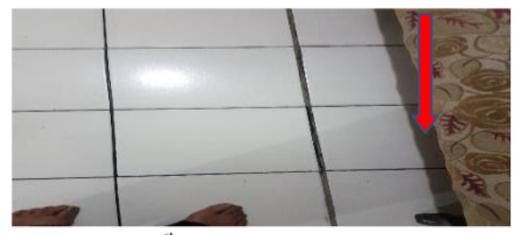
\textbf{Figure 4}. \ \textbf{Slide floor of } 1^{\textbf{St}} \ \textbf{resident's househouse} \ ( \ \textbf{Source: Author document})